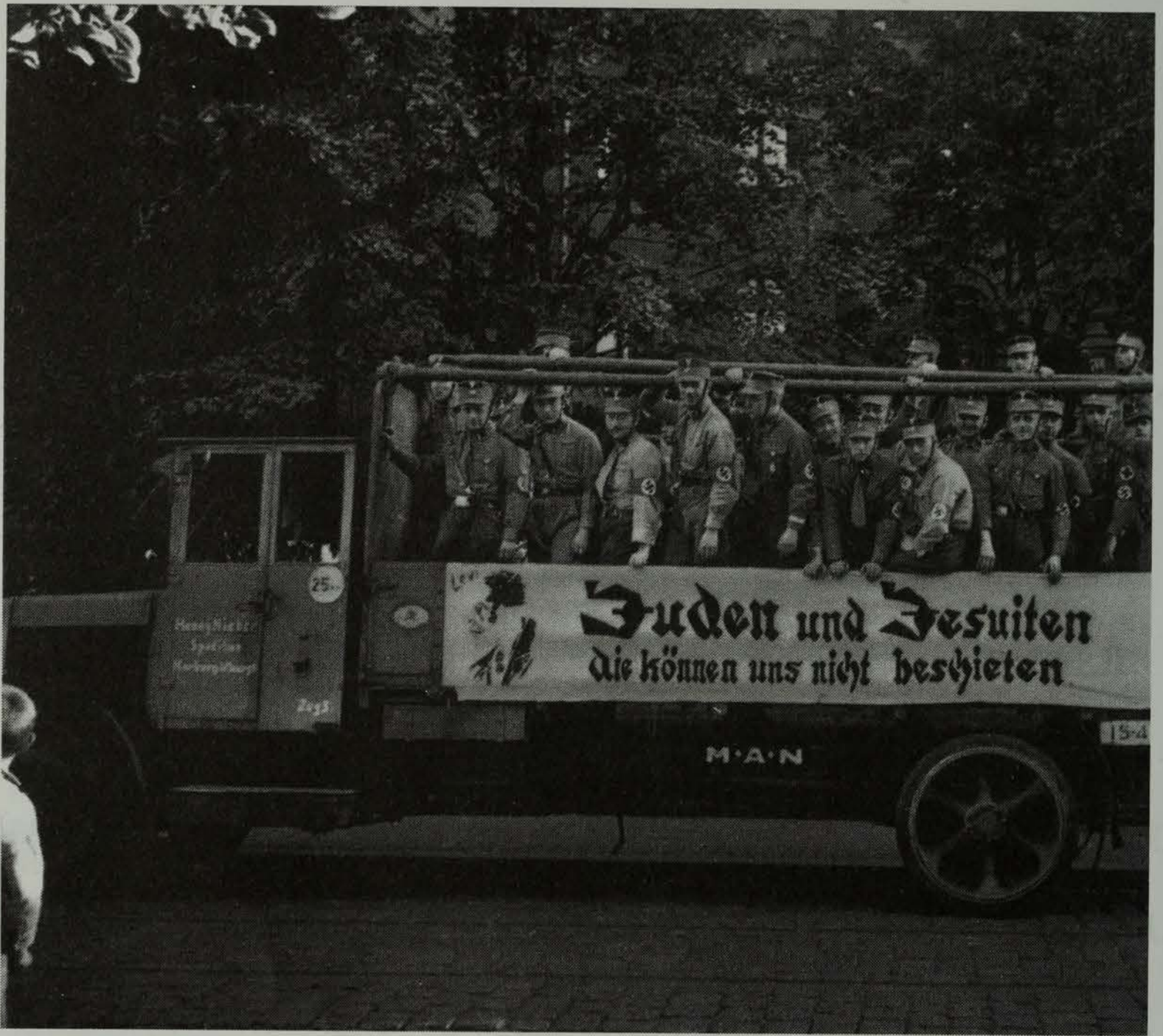
Nazi Storm Troopers on the back of a truck with a banner that reads “Juden und Jesuiten die koennen uns nicht beschieten” (Jews and Jesuits cannot cheat us)