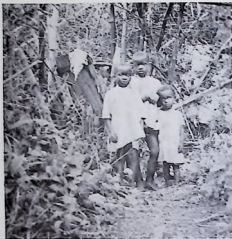
Three little pickneys of Revival, standing in front of the cave where they took shelter for four weeks after the storm. Altogether, one hundred and twenty-four of their fellow outcasts were harbored in this manner from the rigors of the hurricane.

ON returning from Kingston, on Saturday, October 28, I stopped at the Santa Cruz P. O., about forty-eight miles from Sav-la-Mar, and read a storm warning which advised precautions for the next thirty-six hours. I continued on to Sav-la-Mar where, at the P. O., I found a later warning concerning the same storm. I was not greatly alarmed, and went about my work to prepare for Mass next day at Sav-la-Mar and at Orange Hill.