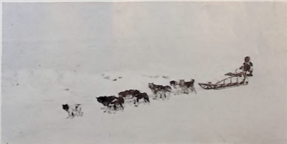
Where mile upon mile presents nothing but a vast stretch of white to the lone missionary traveler in Alaska.

Fit image then may candles be For Lady Mary's purity.