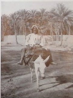
Riding into Baghdad where American Jesuits are celebrating the Mass of the Missions for the preservation of the Faith in the Christians of Iraq.

Most appropriately this custom was discontinued. For by the death of Christ upon the Cross, the veil of the Temple was rent asunder, in indication of the fact that no longer by the barrier of sin was Heaven closed to man, but that, on the contrary, we now have unveiled access to this true Holy of Holies.