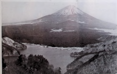
Where Japan's Fuji-yama raises its majestic snow-capped peak into the heavens.

"Did we? Why, ours began two years earlier than yours, and we still have it! Things are so bad