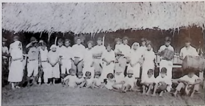
After the marriage of four couples in an improvised bush church at Big Fall, B. Honduras.