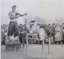
"Then her husband, standing on a chest, brought down his sledge hammer on the bricks and shattered them to pieces."