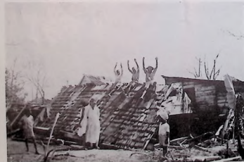
Homeless but happy after the hurricane of October 29, 1933, at Sav-la-Mar, Jamaica, B. W. I.

The next day, Sunday, would be the feast of Christ the King, and as we were preparing to celebrate it in good style at Sav-la-Mar, I prepared a special sermon for the occasion before retiring. When I awoke in the morning, it was quite evident that there would be no special celebration, as it was already raining and the wind was starting to gather force.