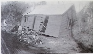
The teacher's cottage—Revival School, after the warring elements had ceased.

At Revival School, I found my teacher's cottage had tumbled down; the old school, which I had some hope of making into a cottage, was hopelessly smashed. Before the storm, only the frame work and the roof had been standing, but now all was