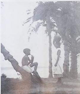
By the banks of the Ganges River. Devil-worshipping Santals only a few years ago,—now smiling children of God.

R ESTRICTIONS of a very unfair nature, have kept us from getting land for schools and churches and dwellings amongst the Santals, except in Monghyr and Bhagalpore. But in the real home of the Santals, Santal Parganas, where there are some 800,000 Santals, the Catholic Church is being discriminated against rather shamefully. However, the two Missions working there have gained some 8,000 souls to the Church militant in the last three years. The movement of the Santals is definitely towards the Church, and the influence which the missionaries are exerting over a rather large area has not failed to arouse "the dog (Turn to page 54)