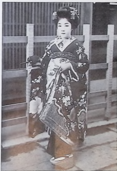
A little maid of old Japan, done up in all her native finery.