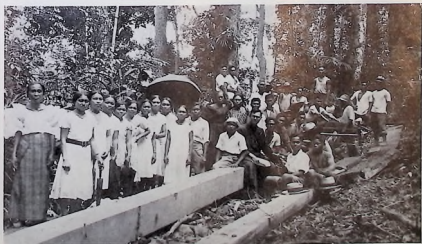
Resting in the forest, ten miles from the town of Clarin, after felling a log for the new Bandica; one hundred and thirty men labor free of charge, out of love for the Holy Child.

from among the more robust young men, about two hundred of whom are required to extricate the fallen trees and place them in position for transportation by sixty of their fellows, driving carabaos. The remainder of the (Turn to p. 54)