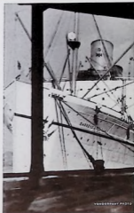
Empress of Japan...pride of the Pacific

"GO EMPRESS" . . . to Honolulu, Yokohama, Kobe, Nagasaki, Shanghai, Hong Kong, Manila. Swift sister ships, Empress of Asia and Empress of Russia, reach Yokohama in 10 days flat. . . via Direct Express Route . Empress of Japan (blue-ribbon Pacific liner) and Empress of Canada reach Honolulu in 5 days, and Yokohama in 8 days more.