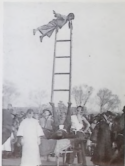
"Again, while the ladder is balanced on the feet of another member of the troupe, the little girl in quick time climbs to the top where she allows herself many delightful pirouettes."

A FEW of the most attractive acrobatics may interest you. A young lady of the troupe consented to have a pile of bricks smashed on her head. While the coolies were setting up what was required for the performance, she was going around in a nervous way, making incantations to her gods, either to make sure of their assistance, or to recommend herself to them in case her skull should be smashed to pieces with the bricks. Then she