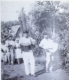
Starting off on the bridal march to four weddings in the bush of Honduras

N OW here in San Pedro Colombia, they didn't even have a rezador . Well, what do they do then? Sit down on the benches and watch; and when that gets too tiresome, they lie down on them and sleep. Outside, and sometimes inside the church, a concoction is served towards 11 P.M., or so. Then things get a little bit lively; it is so nice to have a nocturnal confab, moon or no moon, until you are good and drowsy in the morning by the time for Mass.—Well, I don't approve of that kind of devotion. So about 10:15, after I was finished with my own spiritual exercises, I called my In-