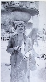
An Arab vendor from Iraq, the ancient land between the Tigris and Euphrates, where at the invitation of His Holiness, Pope Pius XI, Jesuits from the American Assistance are engaging in an educational venture.

"Let me suggest what seems to me a very good means to instill the spirit. It is Catholic fiction. The Indian boy and girl are like all boys and girls in their love for stories. They will listen by the hour. The boys who can read, take the books I give them to the dormitory and read until the lights go out. Furthermore, they are idealists and imitators as well. Catholic fiction will give them the ideals, and I'll wager they will imitate. A story of Catholicism really and truly lived will do more than the whole catechism