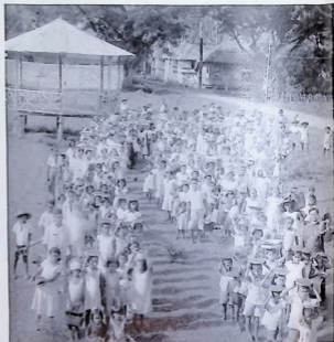
"On our way from the riverside with basins, baskets and cans filled with sand with which we hope to build for the Christ Child a little less unbecoming Bethlehem."

T HE ways of God are wonderful and mysterious and often entirely unexpected. This I discovered for myself, when, having tried every apostolic means within my power to rekindle the sparks of Faith, I finally and almost in despair, not to mention in awesome contradiction to the laws of probable success, raised my voice, if not my heart, in song. I had struck the right note. Immediately, the children were attracted to my side, and soon children and adults were rallying to the scene. I had formerly organized the St. Cecilia Choir of Occidental Misamis, which I founded in Jimenez under the supervision of my Reverend Superior, Father