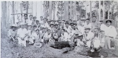
The tree on the ground, to which the boy is pointing, fell on a robber who attempted to steal a log which had been prepared for the new church. The people regard this as a visitation of God's just judgment.

AUGUST 1 , marked the first day of the experiment called general pahina , which means work done for the Church voluntarily and without wages. It began with a Missa Cantata at seven, after which a business meeting was held, and it closed with the singing of the pahina hymn. At nine, accompanied by a band and an alarm of bells, men, women and children proceeded to