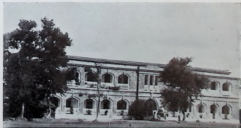
The new dormitory building at Khris Raja High School , Bettiah, Patna Mission, is the gift of an Indian ruler, the Bettiah Raj .

"If this acknowledgement seems to be too slow in reaching you, may we explain that our Post Office is rather primitive, that we have no regular schedule of mail, that we depend on a few freight steamers that come very irregularly . . . so that it is very easy to suffer great delay. Incidentally, we are more than eleven thousand miles away and the average time for a letter from the other side of the world is about five weeks."