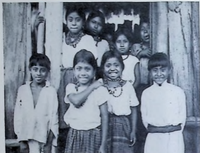
Catholic Keekchi Indian school children of the famous Maya country near Punta Gorda, British Honduras.