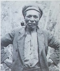
The Ojibway smile. All dressed up in Sunday's clothes. Lake St. Joseph, Ontario.