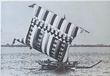
Moros weave their banca sails till they become like painted sails upon a painted sea.

Another touching thing that I noticed during Holy