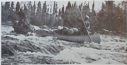
In full action, poling the missionary's land down stream. Sometimes the Indians shot the rapids at full speed, at other times they checked the canoe at every yard, carefully twisting in and out to avoid the rocks.

The evening was the busiest period of all. Some forty Catholics trooped into the tent at (Turn to page 23)