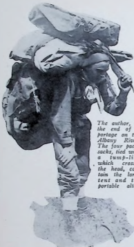
The author, at the end of a portage on the Albany River. The four pack-sacks, tied with a tump-line which crosses the head, contain the large tent and the portable altar.

visit to his Catholic Indians, compiled from a hasty diary where the doings of each day were faithfully recorded.